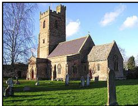
The Church of St. Mary the Virgin, Nether Stowey.