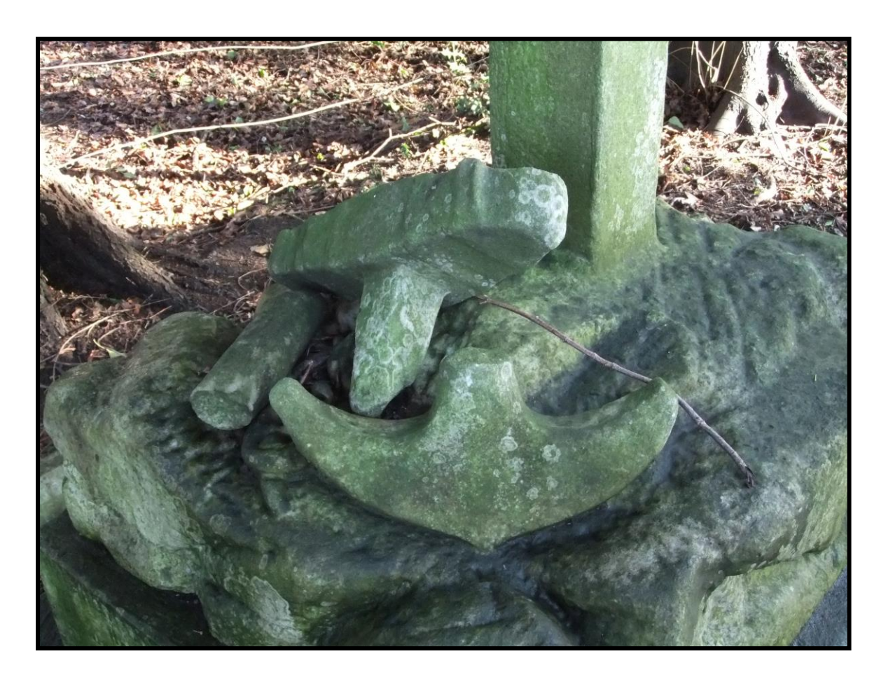
The broken anchor which stands above the memorial to the Blacklock family.