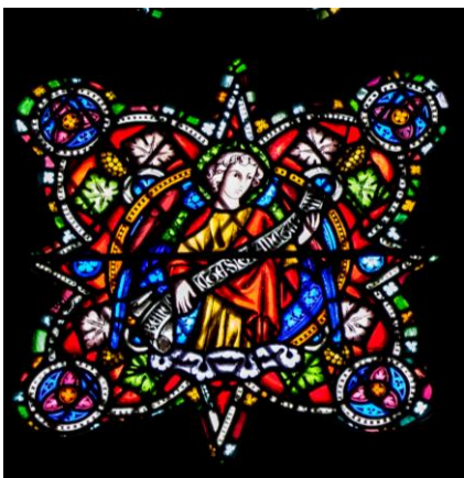
E. Nunc et in Sæcula. Amen Now and Forever. Amen.