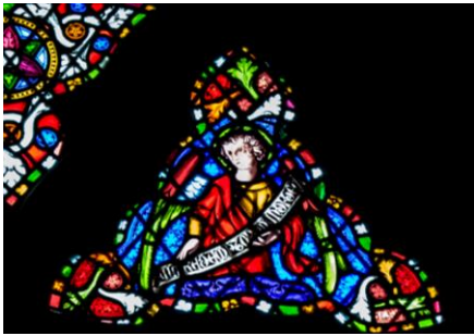
B. Redemptor Mundi Saviour of the World