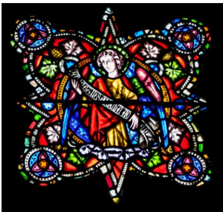
D. Benedicta sit Sancta Maria Blessed be St. Mary (Holy Mary)