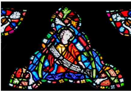
C. Spiritus Sancte Deus Oh Holy Spirit God