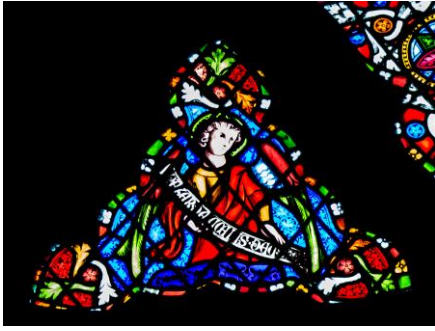
A. Pater de Cœlis Deus Father God from Heaven