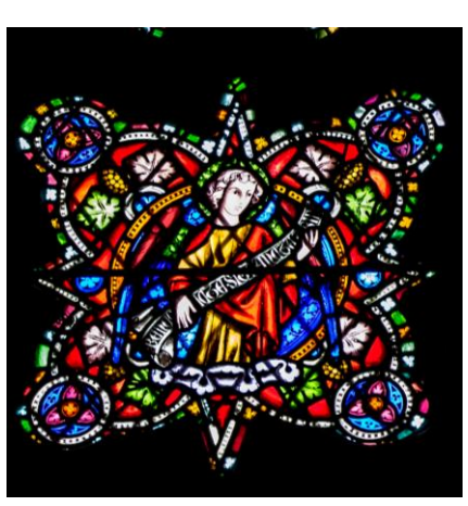
E. Nunc et in Sæcula. Amen Now and Forever. Amen.