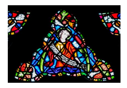
C. Spiritus Sancte Deus Oh Holy Spirit God