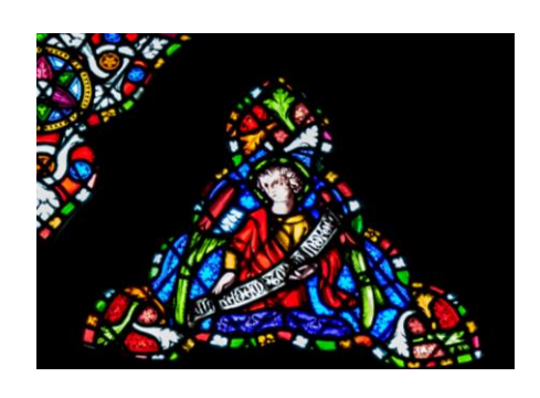
B. Redemptor Mundi Saviour of the World